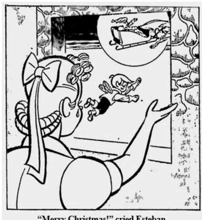
"Merry Christmas!" cried Esteban, flying back to Fairyland

And from far above came Santa's answering call, "Merry Christmas! Merry Christmas to all!"