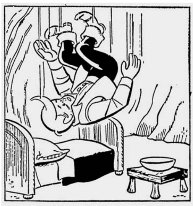
Down, down Esteban fell into a strange weeny room

Esteban shook his head in puzzlement. Could he possibly have gone right through the earth and landed on the other side of the world? But why would people there live in such small houses?