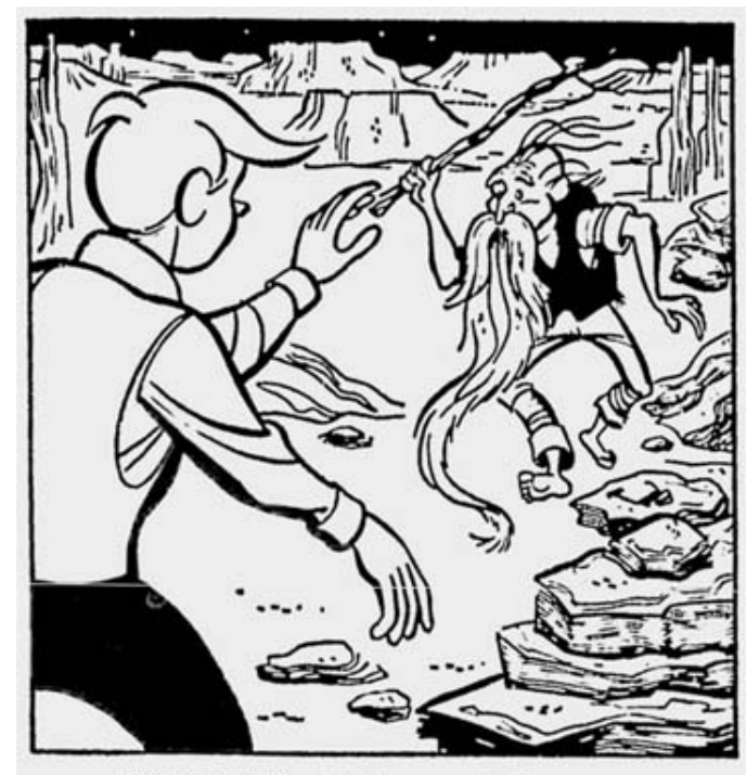
"Fi! Fi! Fi!" cried the man in the moon

But when they landed at last the moon was not the beautiful silver ball Esteban had seen from afar. It was gray and barren and desolate with not a sign of life anywhere - not even a blade of grass.