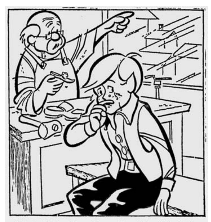
"Try to deliver these slippers." said the old cobbler

Then he sighed and began his journey away from Fairyland.