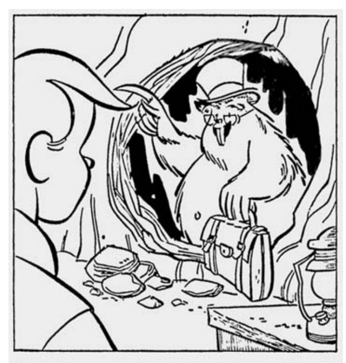
"I will take you to the Snuke," said the friendly mole

"A Snuke," replied the mole. "That is my cousin, the Snuke."