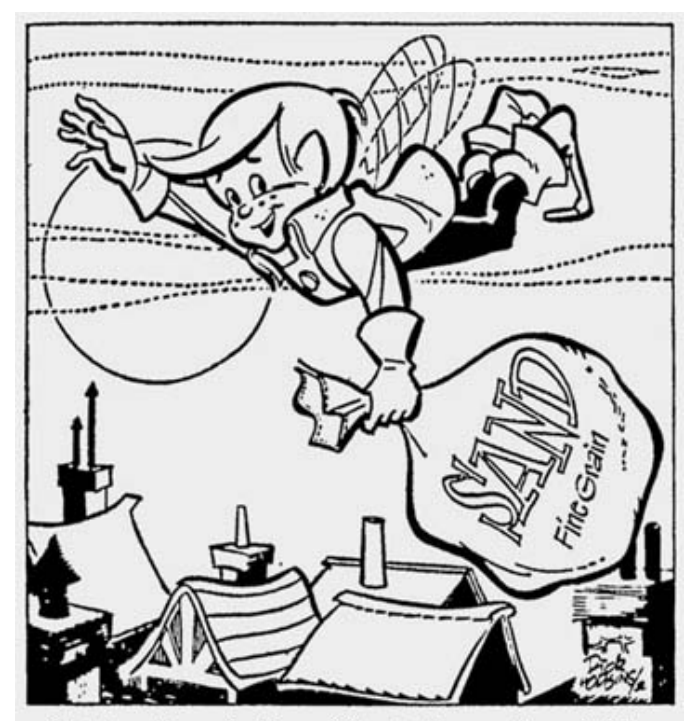
Esteban happily flew off to do the sandman's job

But, he forgot to leave any nickels behind. When he remembered he went back to all the houses he had visited, but he was in such a hurry he put the nickels under all the wrong pillows.