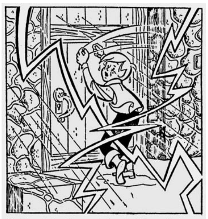
Esteban furiously pounded against the castle doors

For a long time there was no answer and then there was an awful crash. The one light in the castle went out, and the door slowly opened.