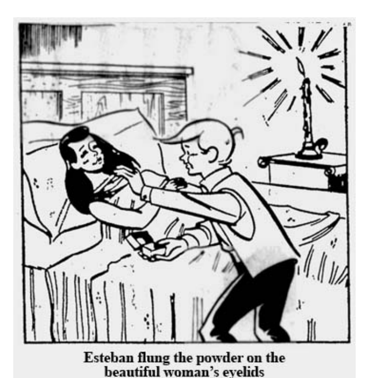
'I have the powder to break the spell!"

"It's done!" cried Esteban holding up the little box.