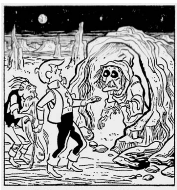
The Hangdog Hag peered at Esteban from the moon-cave

All is lost, thought Esteban in despair. This creature cannot be the Hangdog Hag for she is ugly beyond belief.