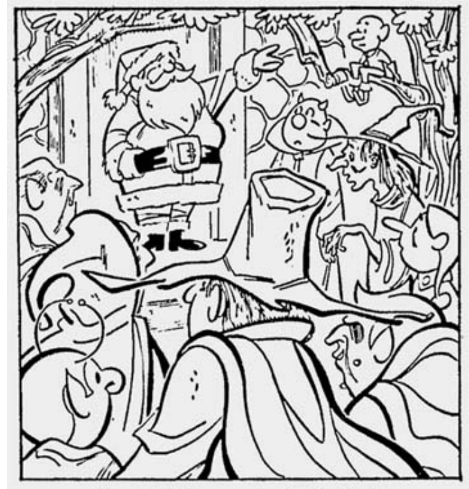
Santa told the people of Fairyland about the great peril

"To the moon." whispered the witch in a cracking voice.